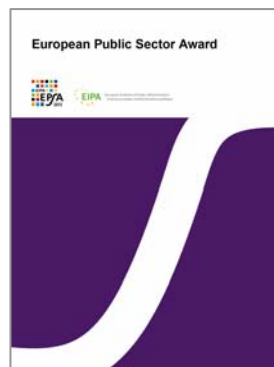
EPSA 2013 Research Report + Best Practices Catalogue