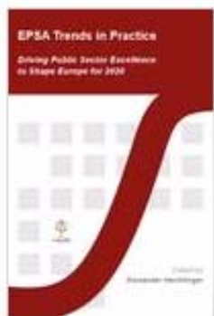
EPSA 2011 Research Report