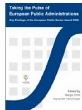
EPSA 2009 Research Report