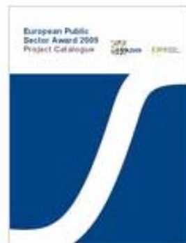
EPSA 2009 Project Catalogue