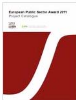
EPSA 2011 Project Catalogue